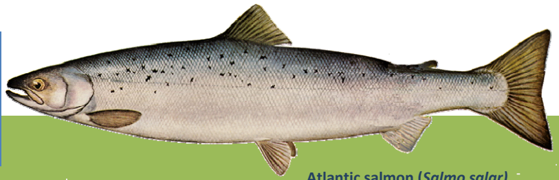
Atlantic salmon ( Salmo salar )